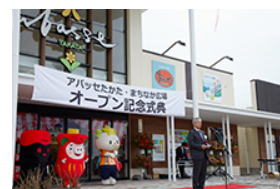
Opening of the Abasse Takata shopping center

Geo Akamatsu has received contracts for work that includes drafting city revitalization plans from cities such as Rikuzentakata, which suffered catastrophic damage from tsunami generated by the Great East Japan Earthquake. These urban revitalization efforts involve the concerted efforts of the government, chambers of commerce, merchants, local residents, and urban renaissance agencies. Taking full advantage of its commercial expertise in earthquake recovery planning, the company is helping build new sustainable urban development models that not only aid in earthquake recovery but more compactly consolidate commercial and public functions in order to build new city centers. The Abasse Takata shopping center opened in April 2016.