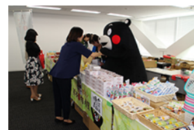
Selling local specialties from five prefectures, including Kumamoto

NREG Toshiba Building held a Recovery Support Sales Event at the Hamamatsucho Building in September 2016. Close to 2,600 people came to shop for local specialties from five prefectures, namely Aomori, Miyagi, Fukushima, Kumamoto, and Iwate. This effort helped support recovery efforts.