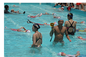
Fully-clothed swimming classes

With the aim of preventing water-related accidents, Nomura Real Estate Life & Support has held classes since 2010 to teach elementary school students in many areas such as Hachioji City, Tokyo, how to swim in clothes. In fiscal 2016, some 977 children took part in the classes.