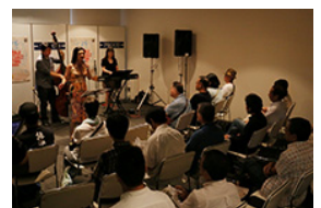
Jozenji Street Jazz Festival in Sendai

Nomura Real Estate Development sponsored the Jozenji Street Jazz Festival in Sendai, a two-day event held in August 2015. The event saw eight groups of artists hold concerts on a specially constructed stage in a PROUD facility showroom. This festival has been run by a volunteer group of city residents since 1991. More than 700,000 people took part in the festival over its two-day run.