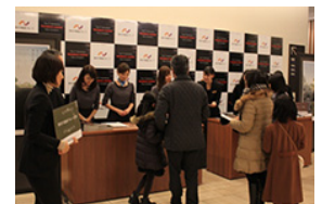
Venue for the Gala Concert held in January, 2016

The Group invited its customers and their children to attend the event and listen to world-class music as a means to inspire and move the children and provide an edifying experience for the whole family. All of the Tokyo Metropolitan Theatre Concert Hall's nearly 2,000 seats were filled for the duration of the two day event.