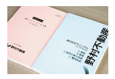
Condominium Design Standards and Condominium Manual

Nomura Real Estate Development has established proprietary design and construction standards, including its Condominium Design Standards, Condominium Design Manual (Structure, Construction, Facilities), and Aftersales Service Standards. These manuals and standards are distributed to all construction companies and other business partners, and efforts are made to increase awareness about these by holding regular seminars. The goal of these activities is to ensure the supply of high-quality, safe, and secure housing.