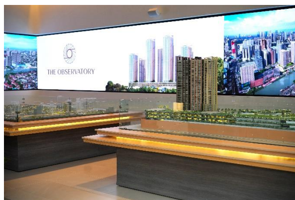
[Inside the Newly Opened On-Site Showroom]