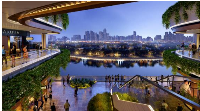
[Rendering of “SORA Tower” / View from the Commercial Facility Level]

Approximately 40% of initial SORA Tower purchasers are Japanese, reflecting strong interest from both local and Japanese buyers as of July 23, 2025. In addition to strong interest from local customers in the Philippines, the project has received high praise from many Japanese clients as well. Feedback from purchasers highlights their expectations for the continued growth of the Philippine economy, as well as further development of the property and the surrounding area.