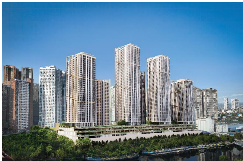
[Rendering of “The Observatory”]

“The Observatory” is the first launched residential project as a part of 4 projects which has been under FNG.