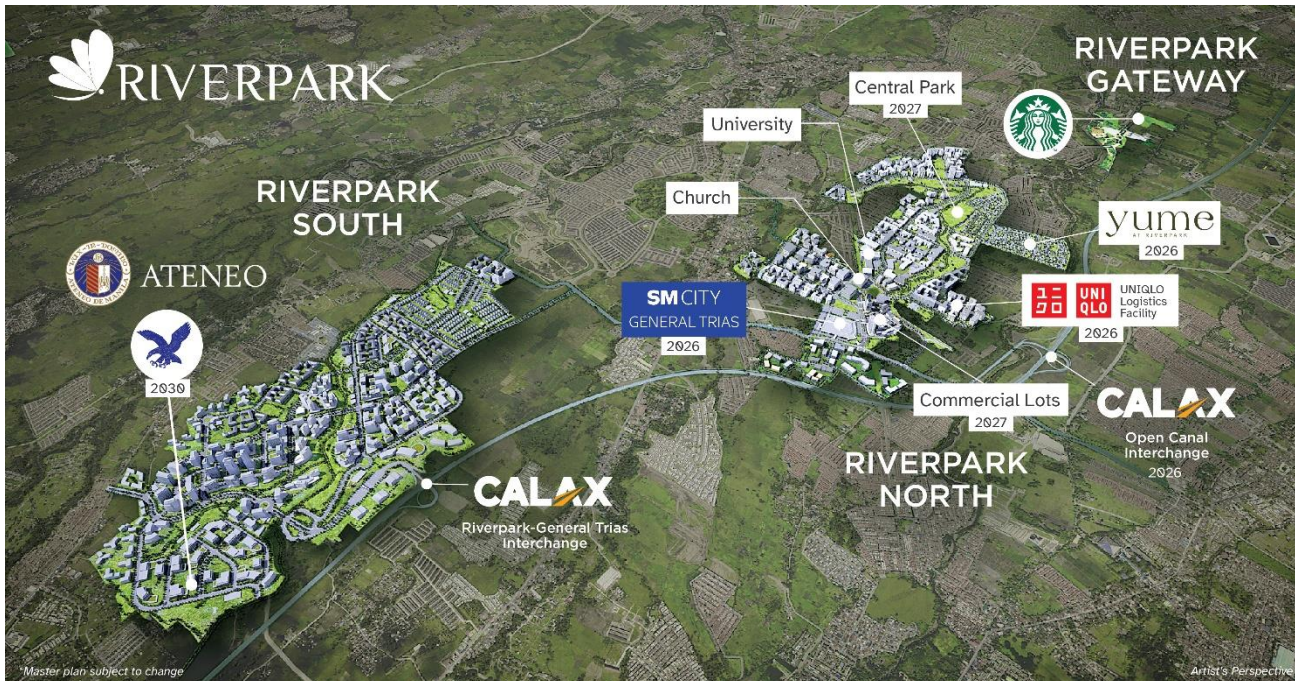
(All years shown in the image indicate the scheduled opening year of each facility.)