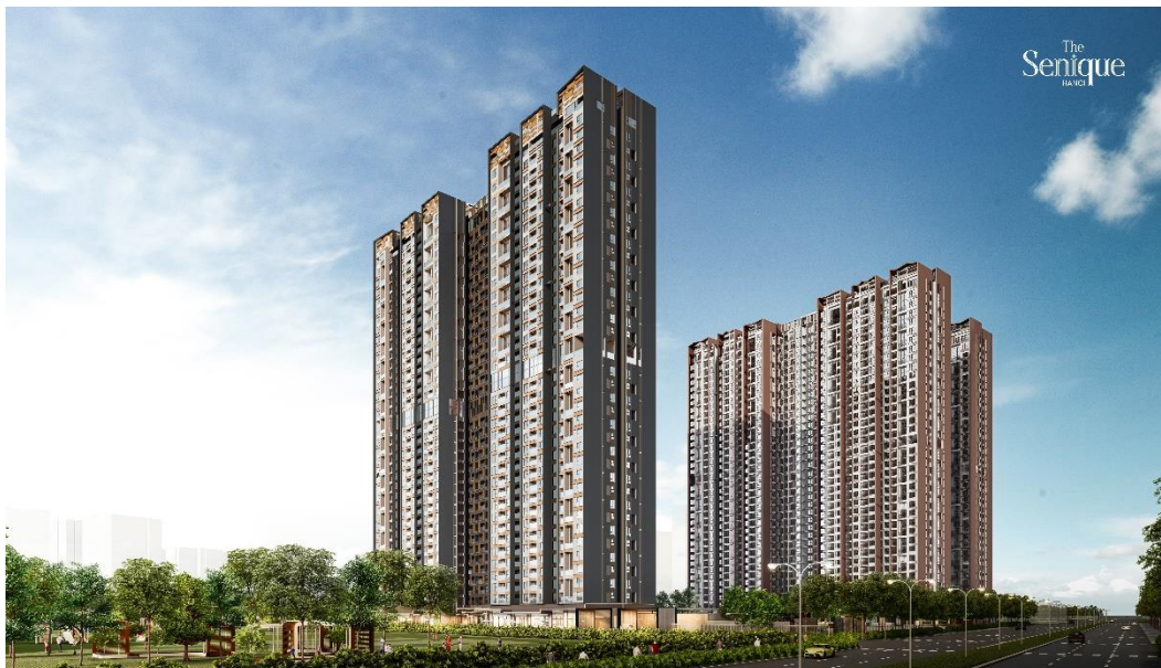
[The Senique facade]