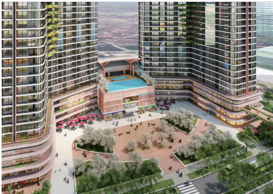
[An image of the completed residential buildings with cherry blossoms]