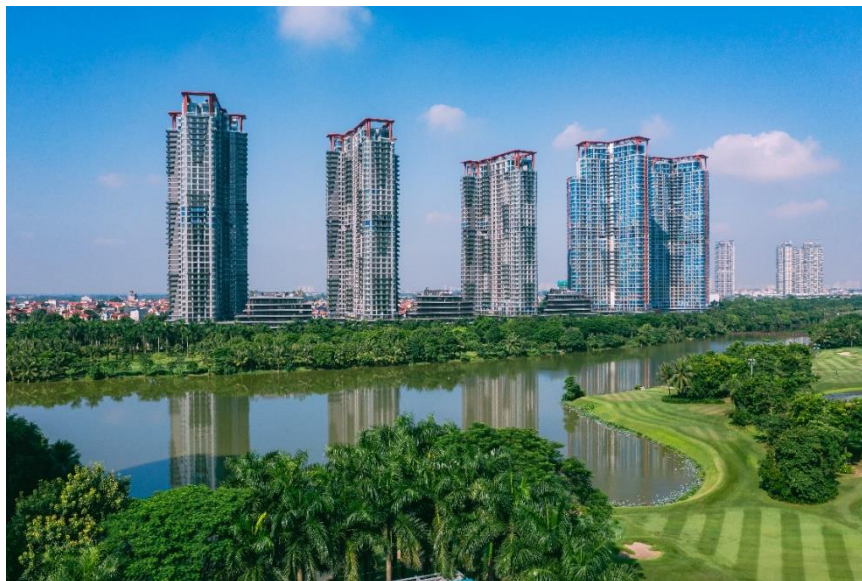
[A picture of Nomura's Ecopark Project block at completion]