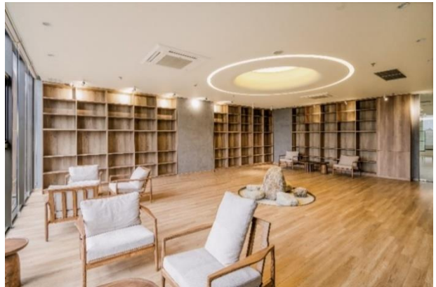
[The pictures above: the completed spa / the pictures below: wooden common facilities (a raised seating area and a book lounge)]