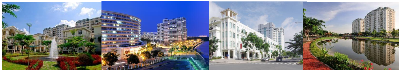
Phu My Hung area