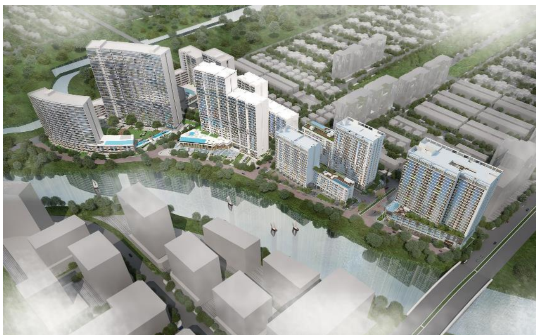
[Completed Concept (including Phase 1)]

Sumitomo Forestry Co., Ltd., Corporate Communications, Ohnishi: +81-3-3214-2270