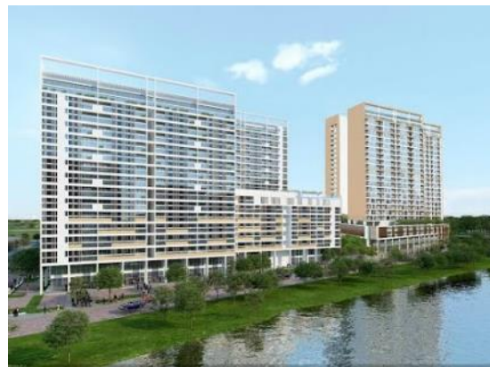
Phase 1 Completion Concept Image